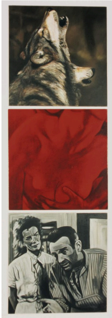
Dog Lover, 2003-4. 3 panels, 6' 2" X 2'. Oil on canvas.