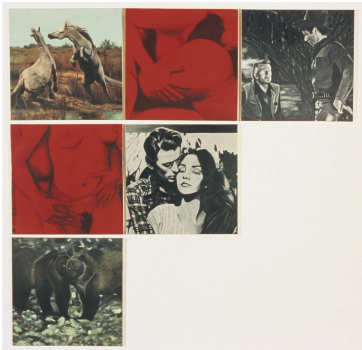
Bareback, 2004. 6 panels, 6'2" X 6'2" (irregular). Oil on canvas.