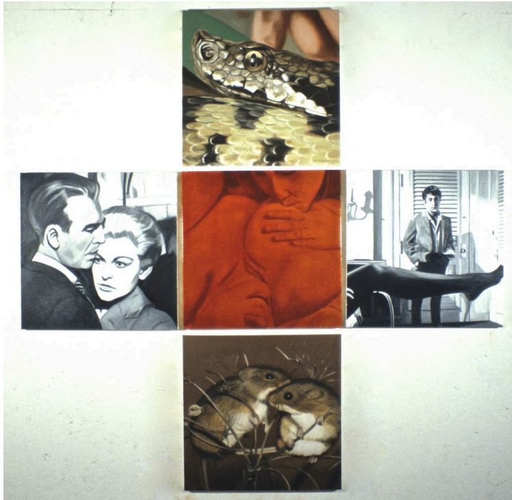
Mouse Lover, 2003-6. 5 panels, 6' 2" X 6' 2" (irregular). Oil on canvas.