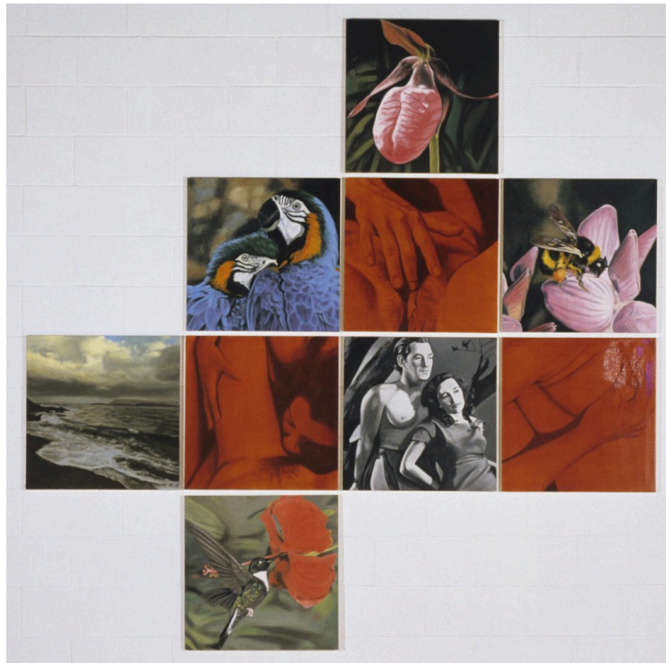
Nature Lover, 2004-5. 9 panels, 8' 2" X 8'2" (irregular). Oil on canvas.