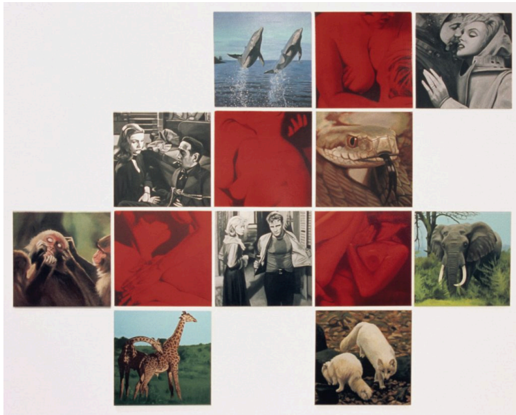
Animal Lover, 2003-4. 13 panels, 8' 2" X 10' 3"(irregular). Oil on canvas.