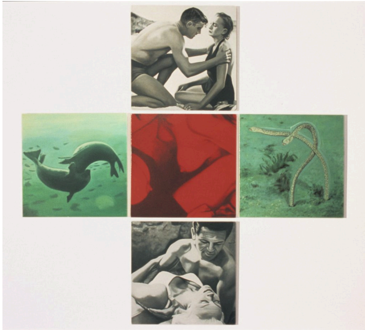
Watersports, 2003-4. 5 panels, 6' 2" X 6' 2" (irregular). Oil on canvas.