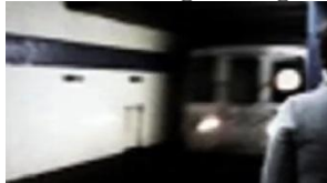
Animal Crossing Underground